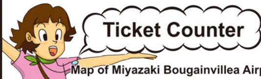
Map of Miyazaki Bougainvillea Airport